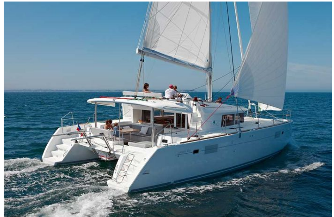
Lagoon 450