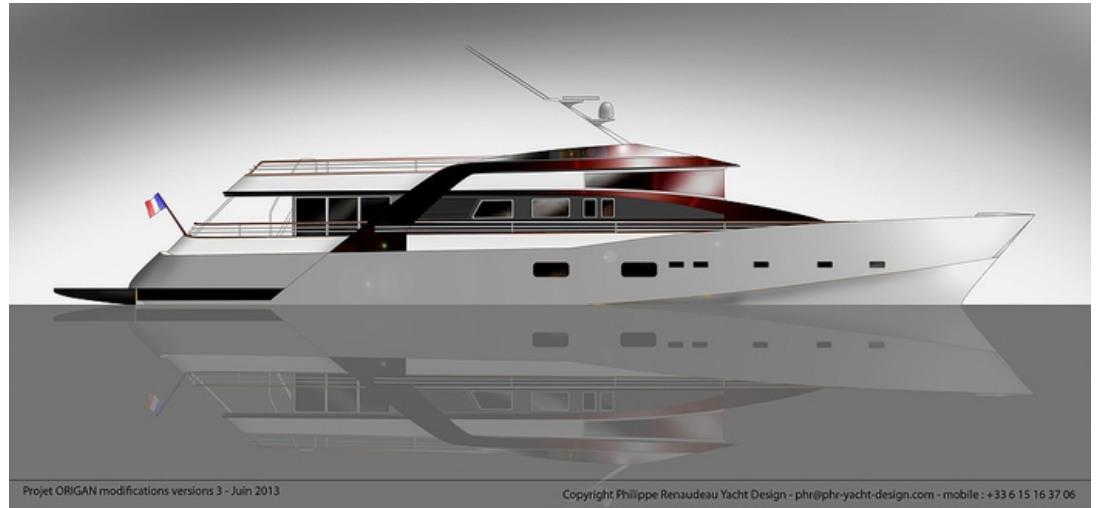
Projet ORIGAN modifications versions 3 - Juin 2013